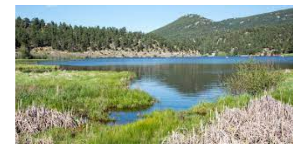
Register for B+B Evergreen Lake Hike

Backpacks + Bleeders are excited to get back together for the first time with this family friendly hike! Join us for this easy 1.4 loop hike around Evergreen Lake. Bring your family, friends or self for this leisure opportunity to connect with your fellow peers. Enjoy beautiful wildlife along the way with your bleeding disorder community! Dogs are welcome and parking is free!