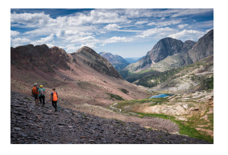
Hike a 14ner - Mt. Sherman August 7th-8th Optional camping the night before