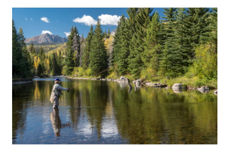
Fly Fishing Clinic September 25th Boxwood/Long Meadow Ranch