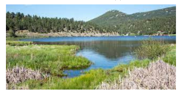
Family Friendly Hike at Ever Green Lake