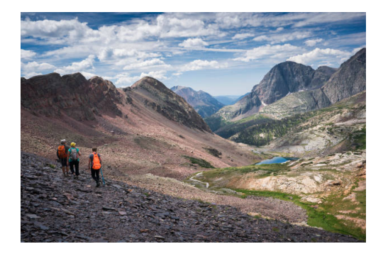
Hike a 14ner - Mt. Sherman August 7th-8th Optional camping the night before