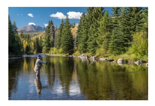
Fly Fishing Clinic September 25th Boxwood/Long Meadow Ranch